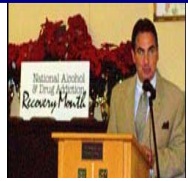
MOAR Celebrated Recovery Month with AdCare Hospital validating the many pathways to recovery with MOAR enthusiastic participants.

MOAR is grateful to be a National Alcohol and Drug Addiction Recovery Month Planning Partner, sponsored by The United States Dept of Health and Human Services, Substance Abuse Services Mental Health Administration, Center for Substance Abuse Treatment, USDHHS/SAMHSA/CSAT.