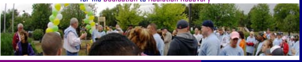
Mayor Domenic Sarno (right) proclaimed W MA Recovery Day before 150 celebrants at The Springfield Recovery High School.