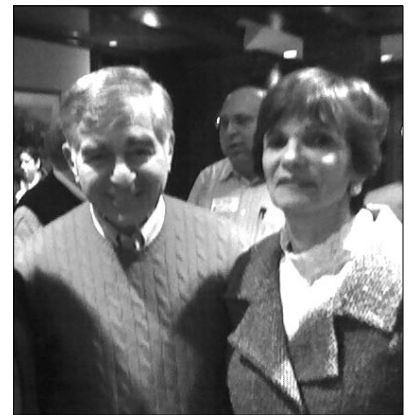
Former Governor Michael Dukakis and his wife Kitty Dukakis

Yet, not a single governor addressed the issue seriously in his or her state of the state message in January. I chaired a Join Together Public Policy panel that developed a Blueprint for the States on addressing addiction prevention treatment and recovery. We're having difficulty getting traction in state capitals around the country. And, to the best of my knowledge, none of the presidential candidates has addressed the issue seriously in the many campaign debates that we have been watching over the past several months.